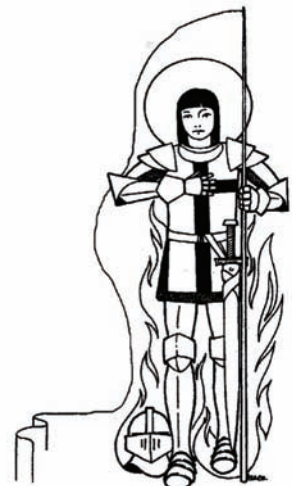
St. Joan of Arc

To become a Catholic a person must contact our Church office and make appropriate enquiries. This individual will have to go through a period of discernment prayer and preparation called R.C.I.A. (Rite of Christian Initiation of Adults)